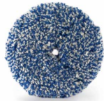
Wool pads for rotary (9.BL180H 9.BL200H 9.BL230H)