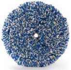
Wool pads for rotary (9.BL180H 9.BL200H 9.BL230H)