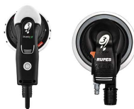
RX153A or RH353